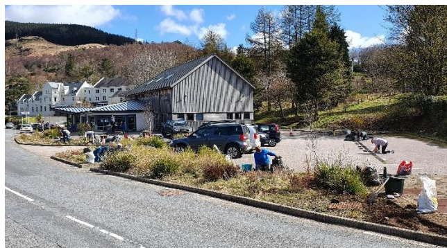
Volunteers working on 3 Villages Hall Maintenance – inside and out